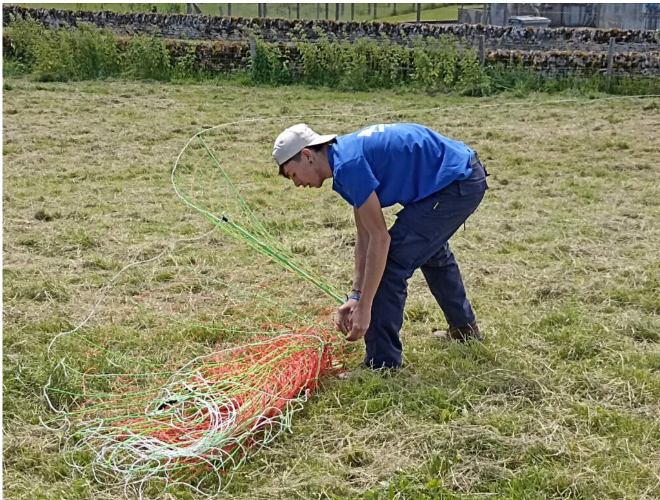
Épreuve de pose de clôture