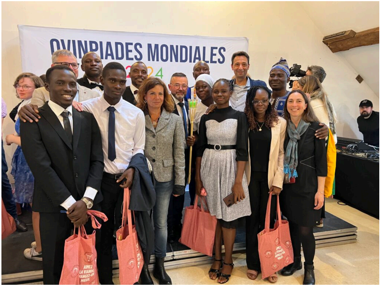
Délégations de l'Afrique de l'Ouest