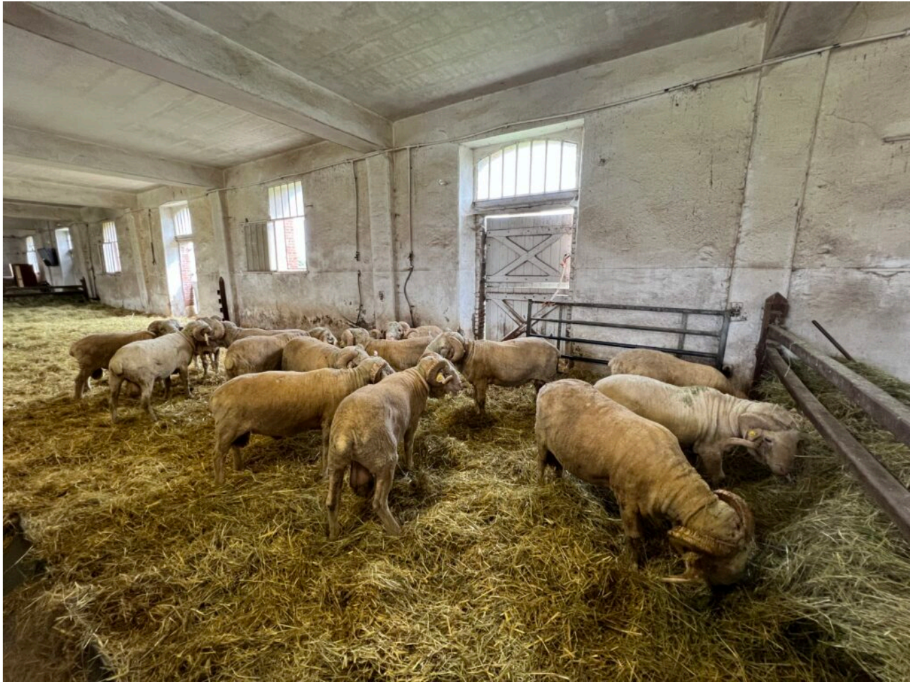
Bergerie Nationale de Rambouillet