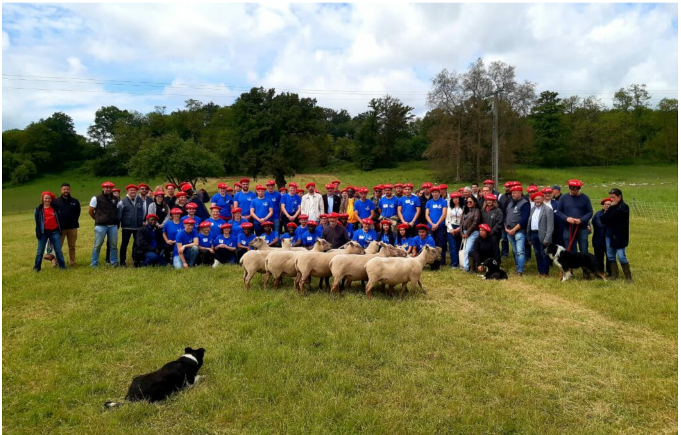
Ovinpiades mondiales 2024