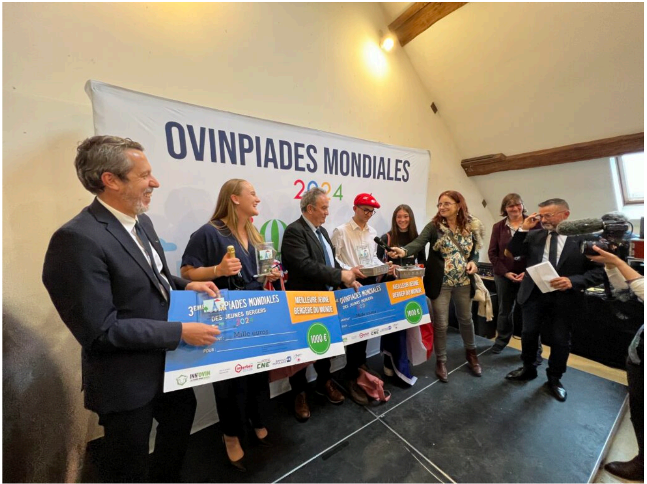
Remise des Prix