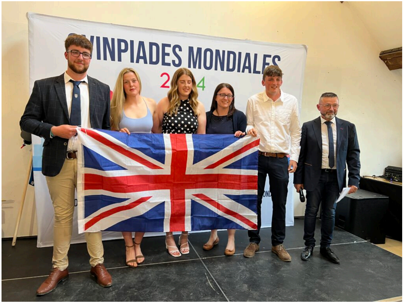
Candidats du Royaume-Uni