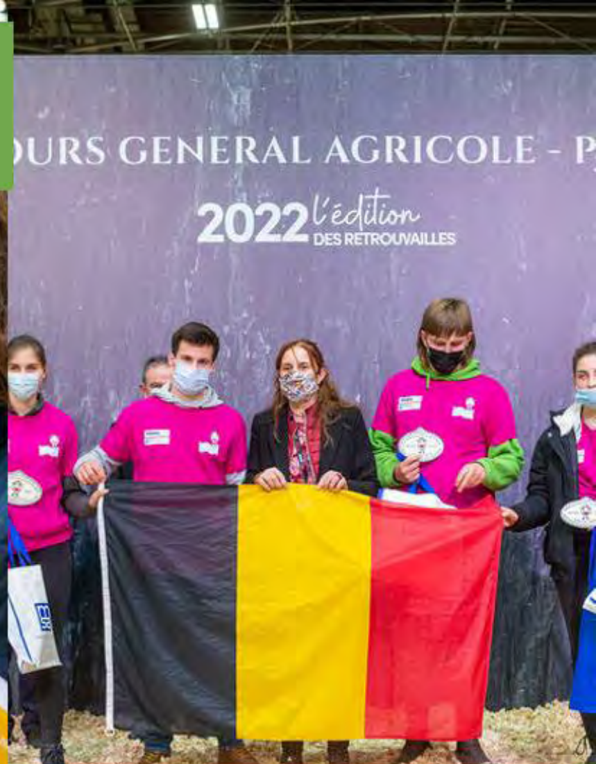
SHARING PRACTICES OF INNOVATIONS AND CREATING LINKS