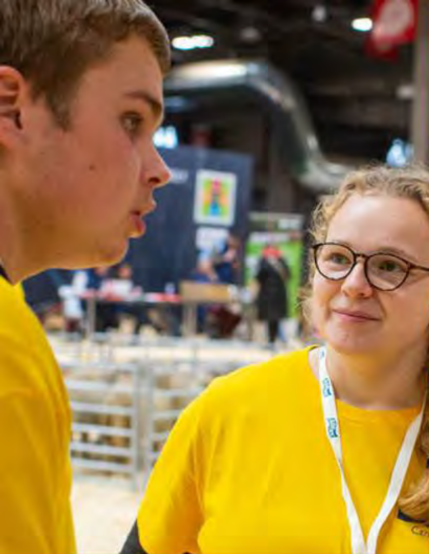
ENCOUNTERS AND A BEAUTIFUL YOUTH EXPERIENCE